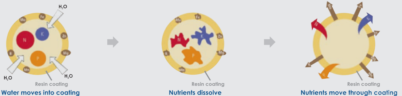
Mode of action of a coated/encapsulated controlled-release fertilizer

Several additives and treatments have been developed to modify the availability of nutrients in mineral (and even some organic) fertilizers. These include 'slow-release fertilizers' that break down gradually to release plant available nutrients (e.g. methylene urea), 'controlled-release fertilizers' that are physically encapsulated in a protective coating (e.g. polymer-coated fertilizers), and 'stabilized fertilizers' that slow N cycling in the soil (e.g. fertilizers treated with urease and/or nitrification inhibitors). All these products aim to extend the release of the nutrients from mineral fertilizers to better match crops' requirements.