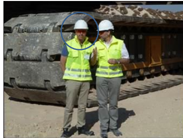
Co-author of this presentation