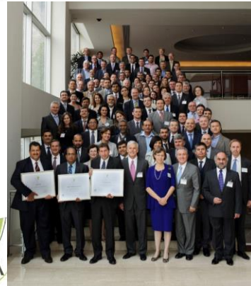
2013 Green Leaf Award Winners: Oxfco (gold), Tata (silver), Profertil (bronze)