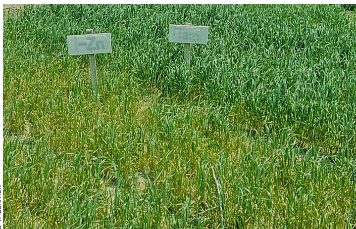
Zn deficiency in wheat in Turkey

Zinc is an essential micronutrient required by crops and people. Almost half the world's cereal crops are deficient in zinc. Zinc deficiency is the fifth leading risk factor for disease in the developing world. Research has shown that in regions with zinc-deficient soils there are often poor crop yields, as well as widespread zinc deficiency in humans. This has been the case in the Central Anatolia region of Turkey. In 1993 a research project found that, through zinc fertilization, yields could be increased six- to eight-fold and child nutrition could be improved dramatically.