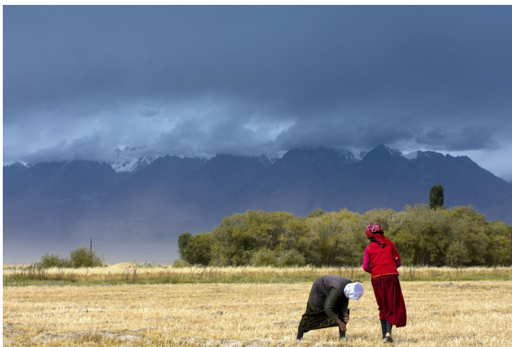
In China's Xinjiang province, women picking up wheat

The iodine dripping project in Xinjiang has also demonstrated that a single dripping can provide iodine for at least six years.